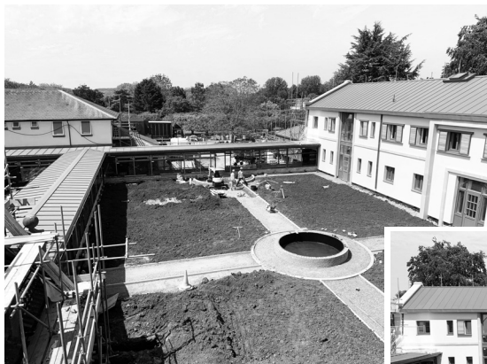
New cloister quadrangle