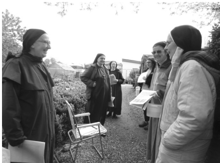
Sisters gathering in the garden

Earlier in the year we managed to hold a Rogation Service in the Convent Garden: using a variation on our usual Rogation Service, a group of Sisters blessed the garden with holy water, including a heap of topsoil awaiting re-distribution as the foundation of landscaping around the Convent buildings. An unexpected part of the proceedings was our discovery of a bee swarm at the bottom of the garden! One of our local beekeepers was able to catch and re-hive the swarm successfully.