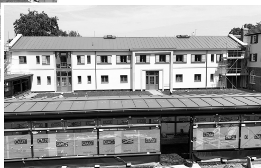
New wing South elevation and cloister