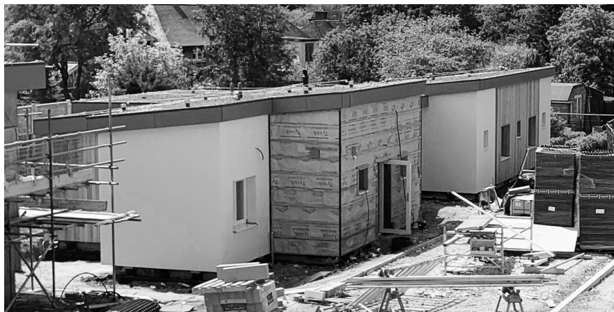
Guest cottages with 'living roofs' seeded and growing